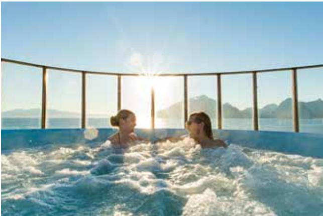
Below: Hot tub. Right: Expedition suite.

Being upgraded in 2021 and equipped with shore power connections, MS Maud is well-suited for expedition cruising. Her bright interiors are appointed in a classic Art Deco style. Colours are inspired by the Midnight Sun, allowing you to relax in warm summer vibes every day of the year. Channel your inner scientist in the advanced Science Center and enjoy daily lectures, sample delicious dishes in the restaurants and enjoy refreshments in the Explorer lounge & bar. There's also a gym and a sauna with beautiful views. Take a soothing dip in the outdoor hot tub before retiring to your comfortable cabin or suite.